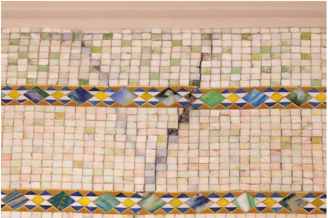
Cracked tile and other damage on the wall will be repaired near the Preston Bradley Hall Tiffany Dome at the Chicago Cultural Center.